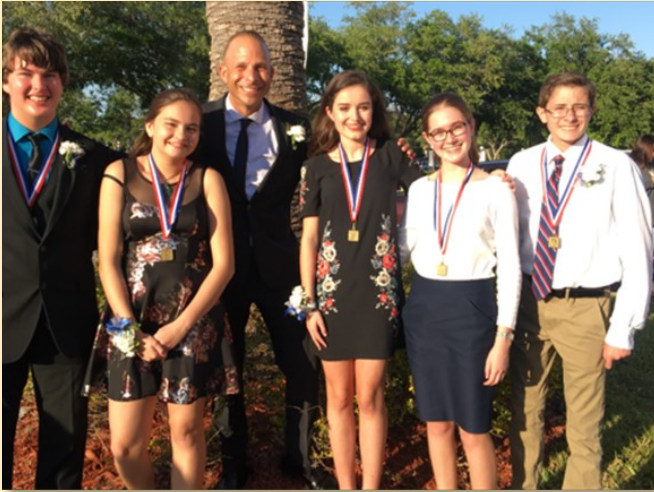
2018 PRIDE Award winners in 8th grade recognizing academic performance in math, science, writing, social studies, and world languages. Congratulations!